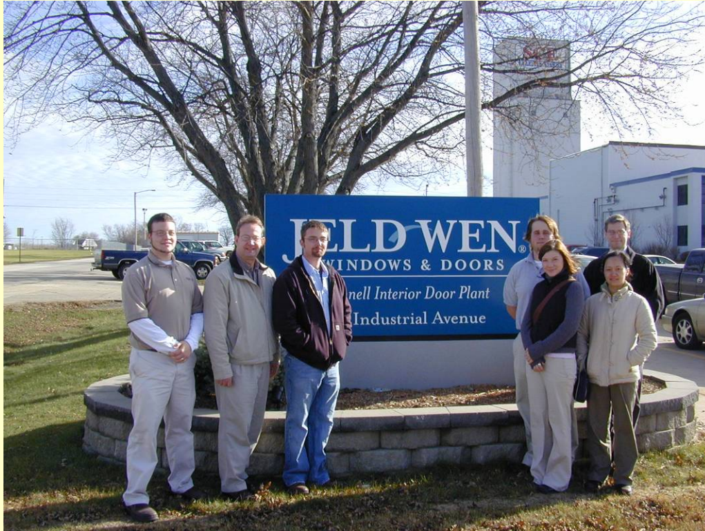
FPS Tour of Jeld-Wen Door Factory, Grinnell, Iowa, November 21, 2005