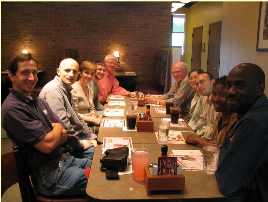
Purdue University students and faculty at a pizza party after successful PhD defense