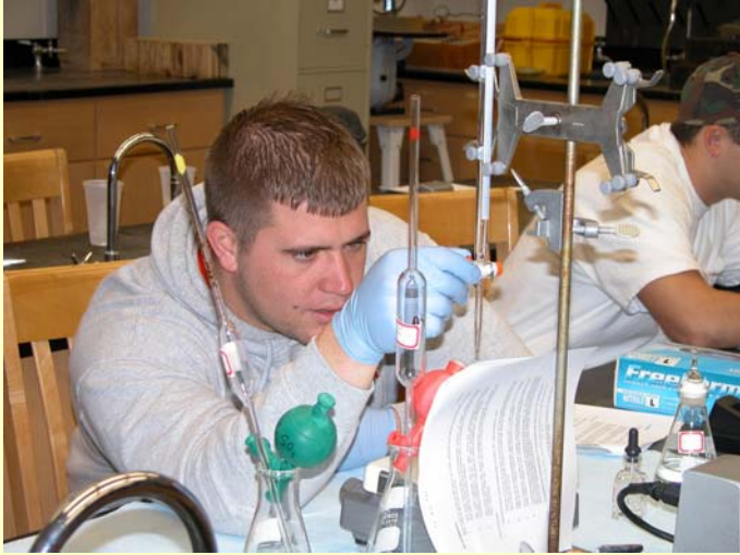
A Virginia Tech student doing something in a lab