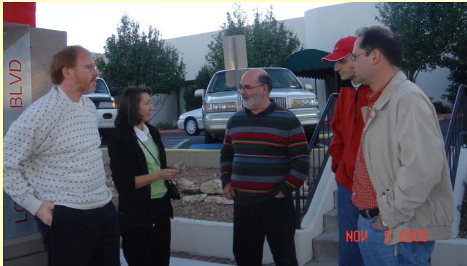
Some of the Board members waiting for a bus in Albuquerque, NM