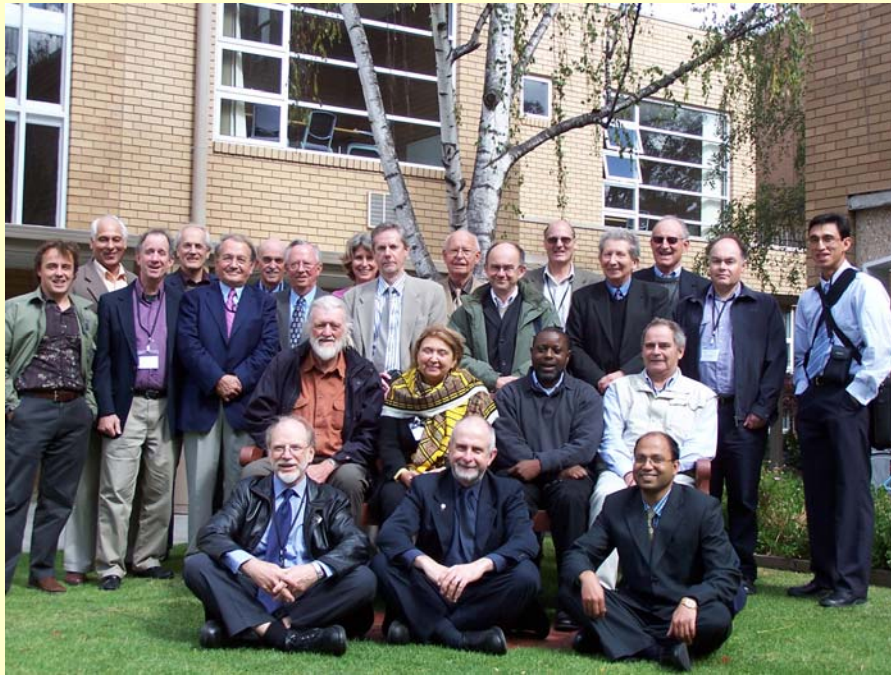
Several of the participants at the meeting venue, St. Hilda's College, including all four United States attendees.

The 2007 meeting will be in Kyoto, Japan from October 25-27, just before the IUFRO All Division 5 conference in Taipei, Taiwan.