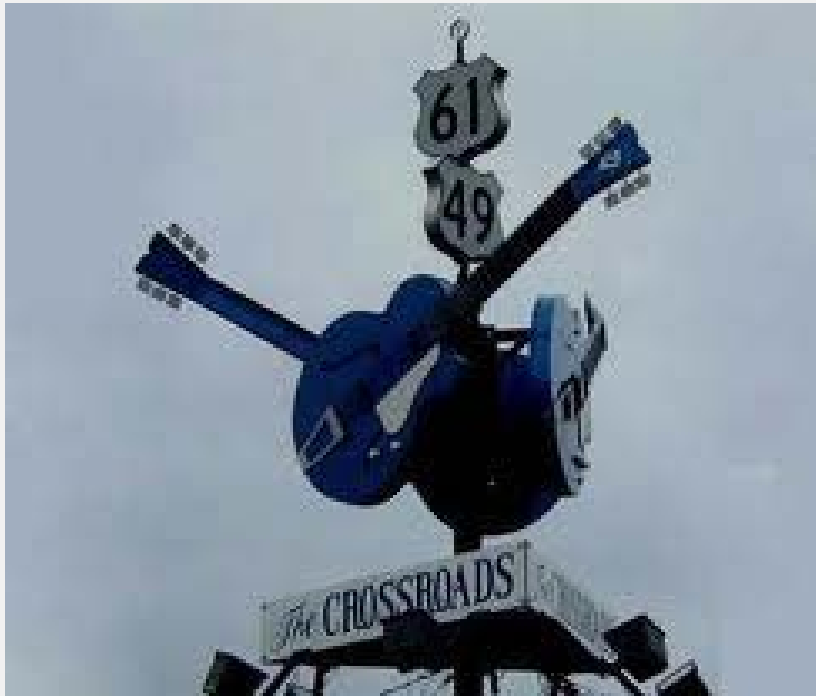
Standing at the Crossroads...