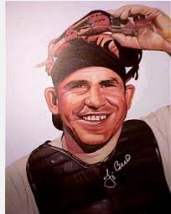
... So Let's Take It!